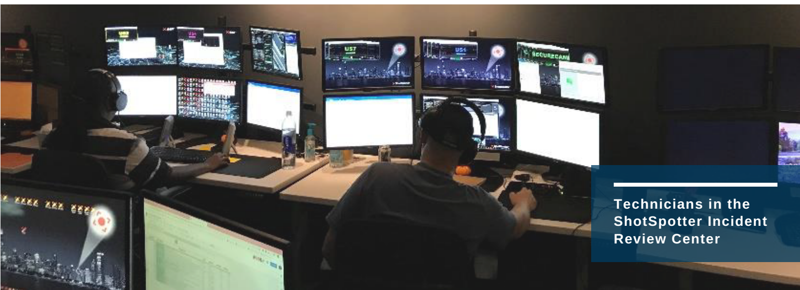
Technicians in the ShotSpotter Incident Review Center

notifications from customer locations around the world to determine whether the impulsive sounds detected by the ShotSpotter algorithm are actual gunshots. 6 The IRC is notified of the majority, but not all, of the impulsive sounds that trigger three sensors. As the ShotSpotter algorithm has improved over time, SST has determined that its system is sufficiently accurate in identifying particular types of impulsive sounds, such as helicopters or fireworks, so that these